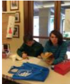
At the end of April our Family Ministries team hosted a Vintage Book and Media Sale in the parish hall. Over $1,100 was raised for Family Ministries. The Family Ministries team would like to thank all of you who donated books, videos and CDs. Over 2,000 items were donated and it was a very successful sale. The Family Ministries team and the Sunday School and Youth had fun organizing and separating all of the books into categories the night before the sale along with their favorite: Pizza!