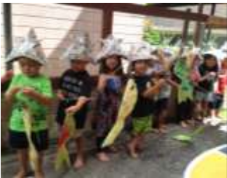
Left to right: Kite flying on Boys' Day; B2 Mother's Day Tea; Na Ohana Family picnic at Shriners Beach.